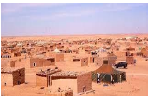
Tindouf in 2021