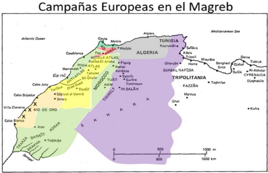
FIG. 5.1 The major regions of the Maghrib and the Sahara